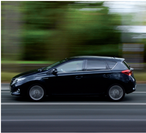
◆ Engine valves

Valve manufacturers check any metal to metal valve seats using pressure degradation methods. Since the new generation car engines are running on higher pressures the manufacturers are in need of new methods for leak testing to keep up with customer needs.