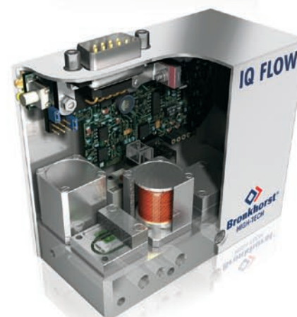
Example of customized manifold solution with Flow / Pressure Control