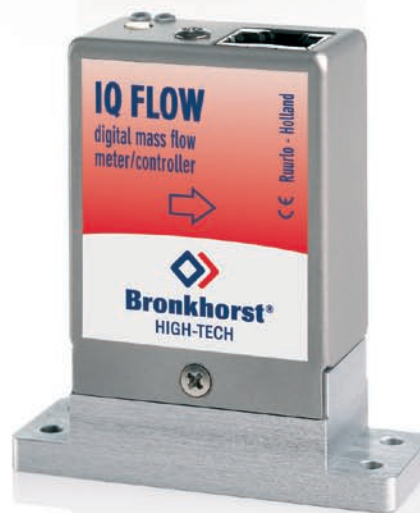
IQF-200 Downported Mass Flow controller (Picture scale 1 : 1)