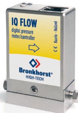
IQP-700 Pressure Controller (Picture scale 1 : 1)