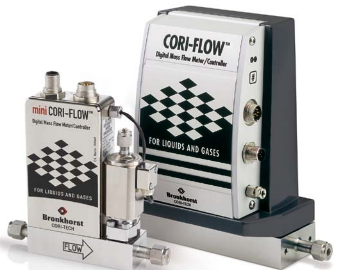
Coriolis style instruments are manufactured and marketed by Bronkhorst Cori-Tech B.V.

smallest 0...20 g/h, highest 0...600 kg/h