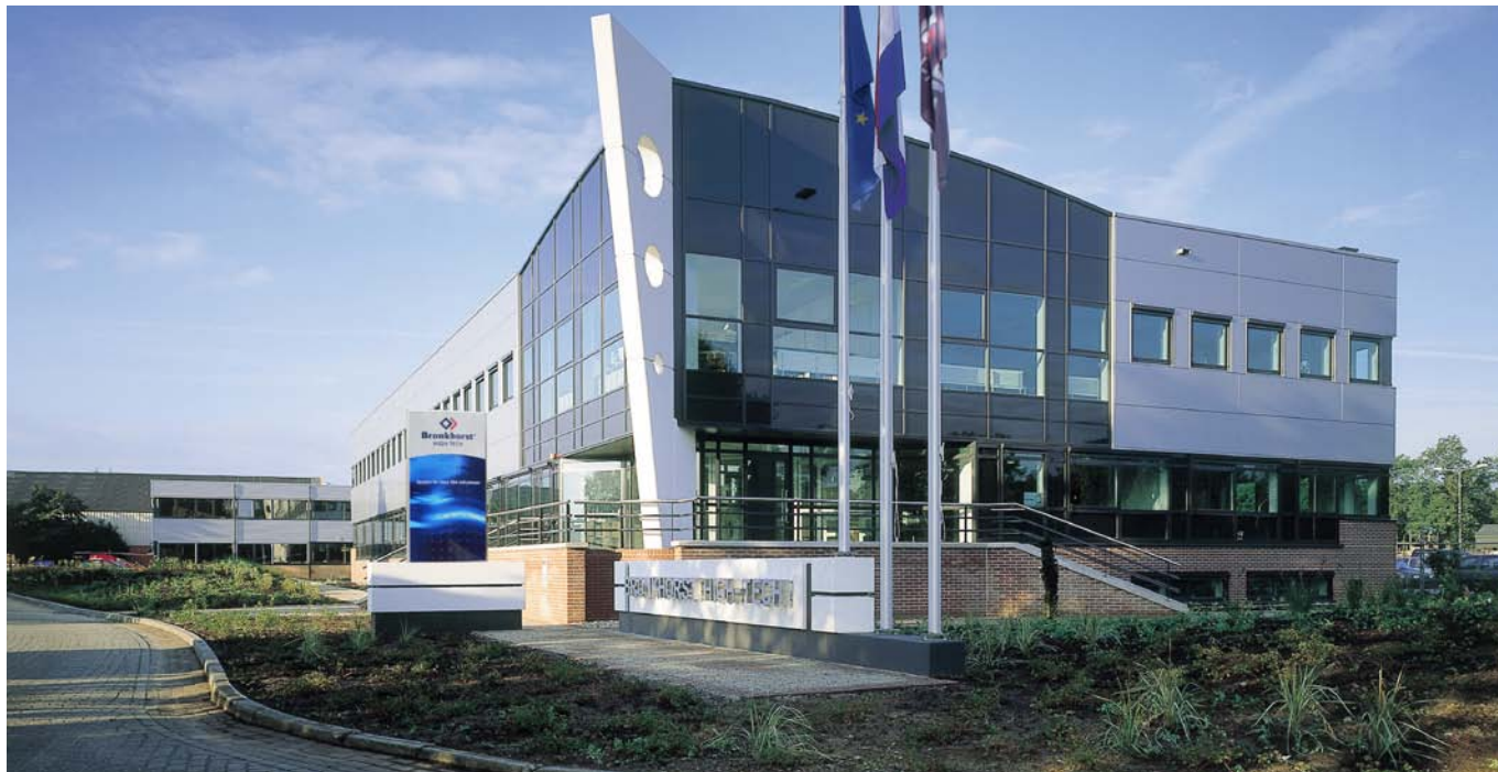
BRONKHORST HIGH-TECH HEADQUARTERS, THE NETHERLANDS